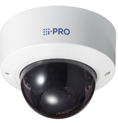
WV-S22700-V2LG (Smoke Dome)