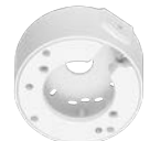
WV-QJB502A-W Mount Bracket