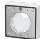
WV-QJB500-W Mount Bracket