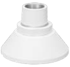
WV-QSR506F1-W Mount Bracket