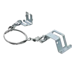
WV-Q105A Mount Bracket