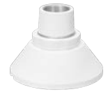
WV-QSR506F-W Mount Bracket