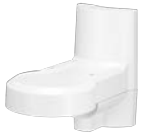
WV-QWL502-W Mount Bracket