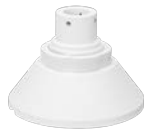
WV-QSR506-W Mount Bracket